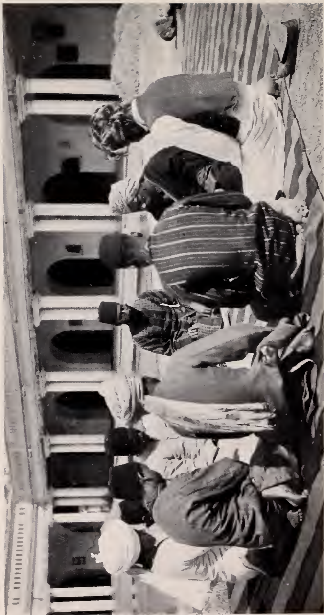
A class in an Oriental college in Hyderabad